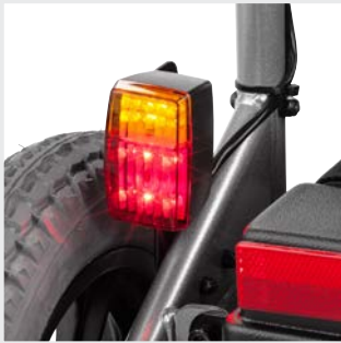
Long-life LED lighting available as an option