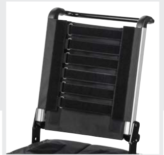
Adjustable seat and back