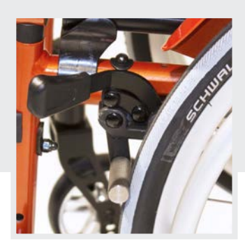
Unique brake with extremely low actuation force