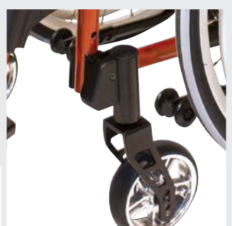
Seat inclination up to 12° for precise adjustment options (series)