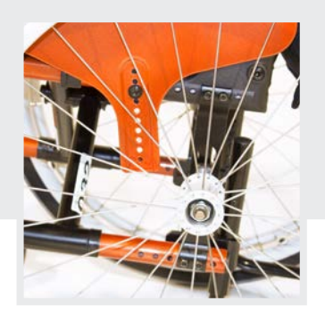
3° wheel camber