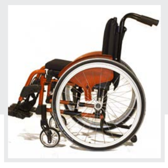
Attractive for your everyday activities