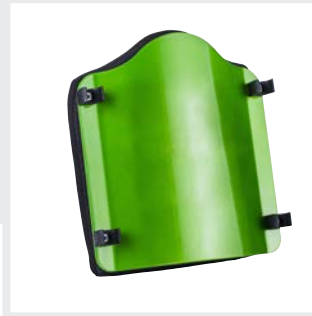
In frame colour with Flash logo