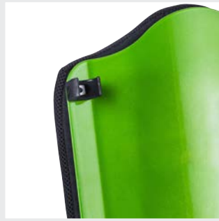
For assembly to back tube without the use of tools