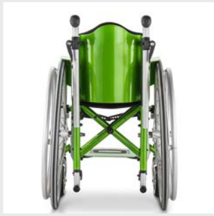
Detachable, anatomic back shell in aluminium