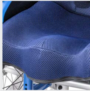
Integrated abduction wedge ensures good leg guidance