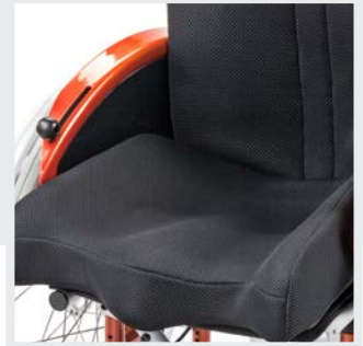
Quick and easy assembly