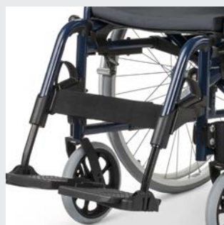
Leg rests can be swung inwards and outwards