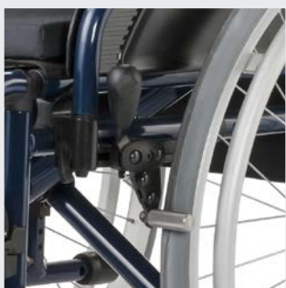
Knee lever brake