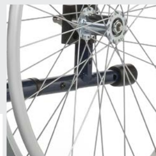
Rubber ferrules as standard