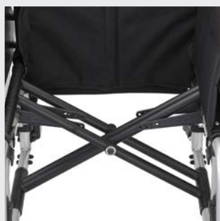
Double cross in series