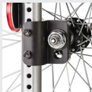
Wheelbase extension by turning the varioblock backwards