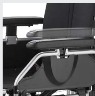
Height-adjustable side panel with depth-adjustable armrest