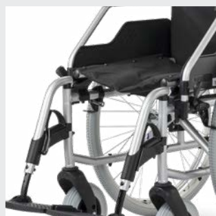
Seat height variable at the front