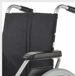
Adjustable back strap