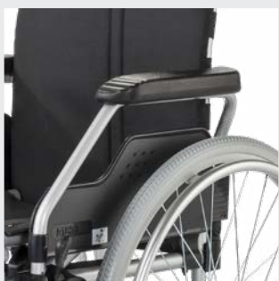
Side guard can be conveniently removed