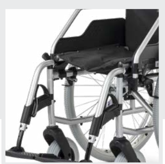
Seat height front variable