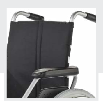
Adjustable back strap