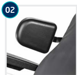
Article 1080610/ 1080612