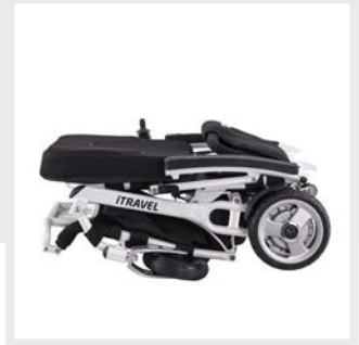
Small pack size