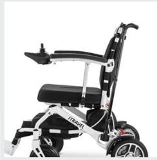
Cane holder (without cane) standard