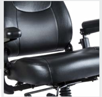
Spring-loaded comfort Seating system