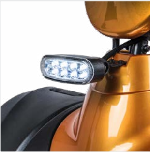
State-of-the-art LED technology