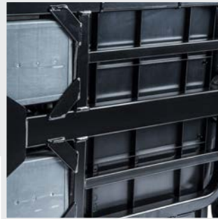
Extremely robust cassette-type frame