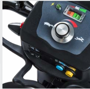
Simple user guidance