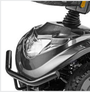
State-of-the-art LED technology