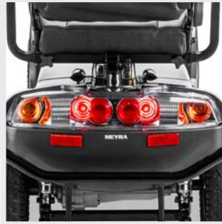
700/3,000 Watt motor