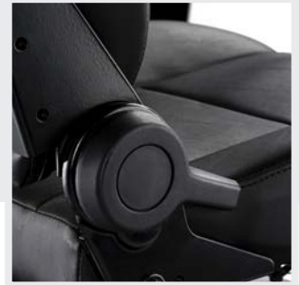
Luxury seat with infinitely variable adjustment