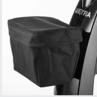
Weather protector for shopping basket