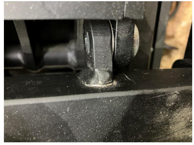
Example failure 5